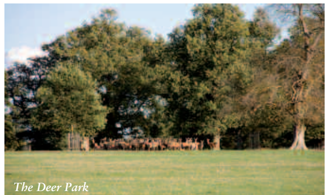
The Deer Park