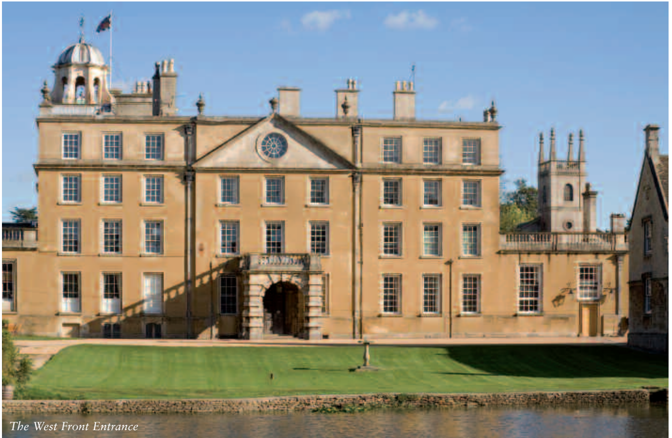
The West Front Entrance